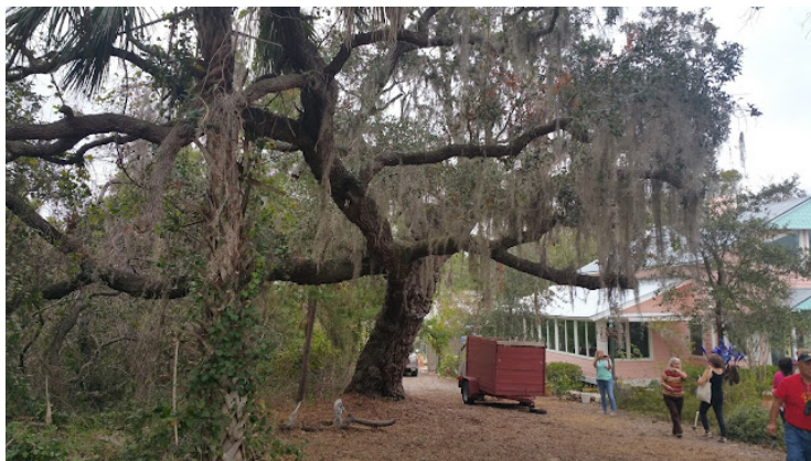
The giant oak tree under which John Muir recovered from Malaria and formed his views on nature and man.

Day two focused on the Florida portion of John Muir's walk to the Gulf that originated in Indiana. After taking a ferry from Savannah to Fernandina Beach, Muir walked along rail road tracks through Gainesville and on to Cedar Key, where he had planned to board a ship to the Amazon. However, a malaria-carrying mosquito that bit him while sleeping in the Savannah Cemetery had incubated causing him to collapse. He was nursed to health by the wife of a sawmill owner for several months, spending much of his time under a giant oak tree observing the neighboring islands.