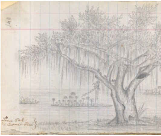
John Muir's drawing of the giant oak.

While he went through near death experience, he began to rethink. What is the difference between man and other creatures to the universe? It was here that his ideas about the sanctity of all living beings formed and, when he was well enough, he boarded a ship to Cuba before embarking on a boat from New York City to San Francisco and heading to his beloved Yosemite in the Sierra Nevadas.