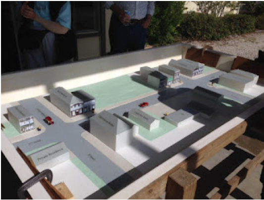
A model of downtown Cedar Key before filled with water.

While he went through near death experience, he began to rethink. What is the difference between man and other creatures to the universe? It was here that his ideas about the sanctity of all living beings formed and, when he was well enough, he boarded a ship to Cuba before embarking on a boat from New York City to San Francisco and heading to his beloved Yosemite in the Sierra Nevadas.