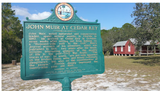
Historic marker for John Muir.

Day two focused on the Florida portion of John Muir's walk to the Gulf that originated in Indiana. After taking a ferry from Savannah to Fernandina Beach, Muir walked along rail road tracks through Gainesville and on to Cedar Key, where he had planned to board a ship to the Amazon. However, a malaria-carrying mosquito that bit him while sleeping in the Savannah Cemetery had incubated causing him to collapse. He was nursed to health by the wife of a sawmill owner for several months, spending much of his time under a giant oak tree observing the neighboring islands.