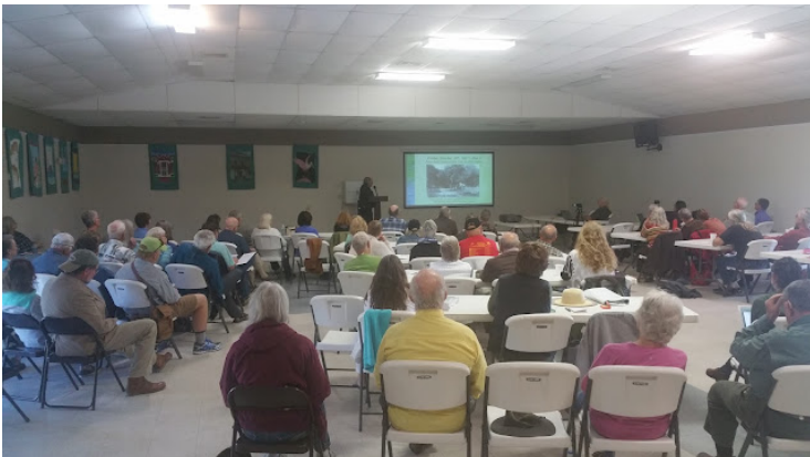
Participants at the conference.