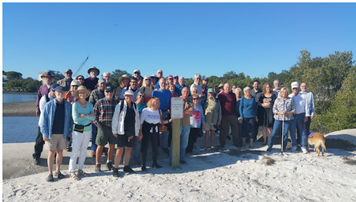
Visitors to John Muir's place of recovery on Cedar Key.