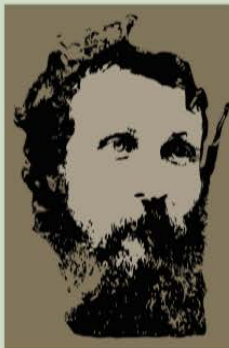
WISCONSIN FRIENDS OF JOHN MUIR

"When we try to pick out anything by itself, we find it hitched to everything else in the Universe."